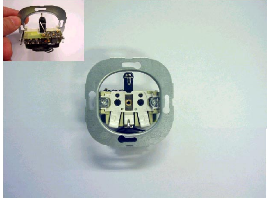
AC 220/240 V (110/120) Socket-Transmitter

According to the manufacturers there are an estimated 500,000 to 1,000,000 eavesdropping devices in private possession in Germany. Anyone who has visited a public security exhibition like "Security" in Essen knows that by far the most popular hall is the one where the listening device suppliers are. A bug the size of a sugar cube only costing a few hundred Euros can eliminate development investment, competitive advantage or even a whole company in no time at all.