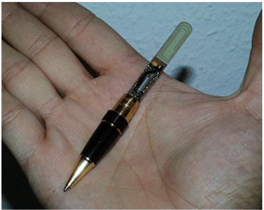
Ballpoint pen with built-in high performance bug

you anything else?" These words may not be uttered but through the internet the purchase is just as easy.