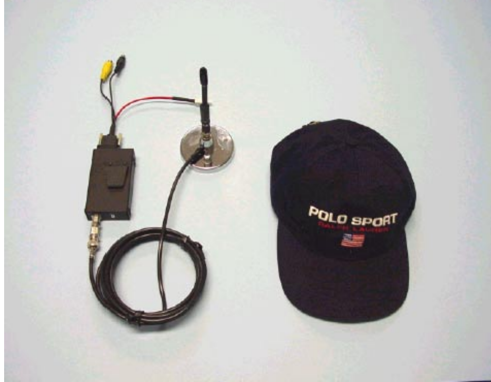
Observation Kit Video Baseballcap

How many people realise that just by analysing compressed HF radiation from a monitor you can reconstruct a live display any text or CAD drawings (in CAD quality of course) on a remote computer screen? This is how a trained TV technician or gifted model-maker can watch a competitor's price calculations live on a modified TV from a safe distance. Of course this compressed radiation is an security loophole for surveillance cameras too. Defending against this kind of spying is totally unspectacular and yet so important. One only has to know about this kind of attack and keep abreast of developments.